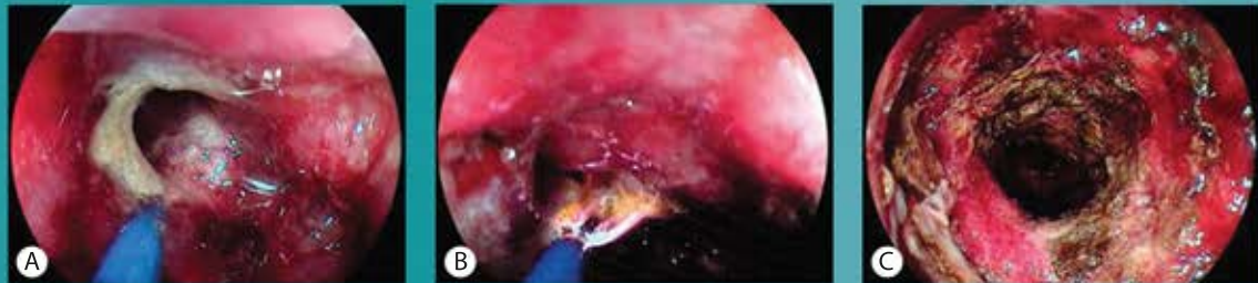
(A) Esophageal cancer pre-treatment. (B) APC treatment of the tumor. (C) Esophageal cancer following treatment.